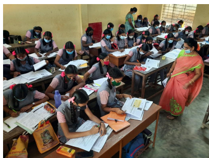
The Tamil Nadu Government introduced a raft of educational

While budgets have been announced by various state governments, let's look closer at how they fare in providing access to quality education to children.