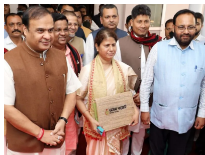
The Assam Government launched the Mission Zero Drop-Out for